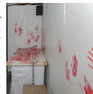
The Haunt, Cedarburg