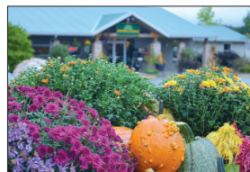
Johnson's Gardens, Cedarburg