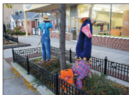
Fall into Grafton

Cedarburg artists open their studio doors to the public Oct. 11 through Oct. 13 with a free, self-guided Covered Bridge Art Studio Tour. Hosted by the Cedarburg Artists Guild, the tour gives guests an up-close and personal look at the spaces that inspire the work of more than 50 of Southeastern Wisconsin's finest artists. Artists will be working during the event and are always happy to stop what they're doing to greet visitors, demonstrate their talents, talk with guests and sell their artwork to interested buyers. The rural drive between studios provides the beauty of farm fields, pumpkin patches, the Lake Michigan shoreline, rivers, picturesque small towns and even the last remaining wooden Covered Bridge in Wisconsin. For a map and other event details visit cedarburgartistsguild.com .