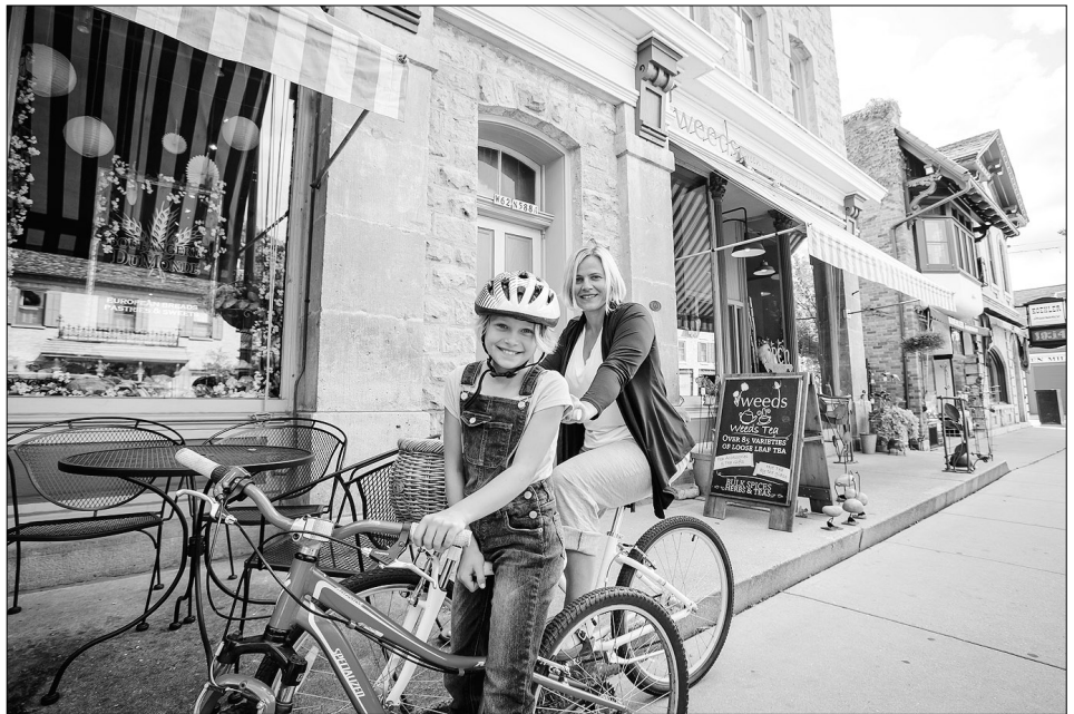
A mother and daughter bike in downtown Cedarburg.

Mequon and Thiensville are filled with activities to