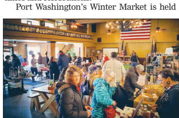
Port Washington Winter Market

Nov. 11 is Veterans Day, dedicated to honoring and remembering those who have served in the United States Armed Forces. Many of our communities will be holding programs and observances in honor of this very special holiday – visit the websites of our local communities to find times and celebrations.