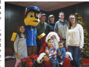
Breakfast with Santa

Be a tourist in your own town this holiday season. For information on all these activities and more, pick up a copy of the Ozaukee County Tourism Guide, available at area chambers and visitor centers, or visit www.ozaukeetourism.com and follow the Ozaukee County Tourism Facebook page. On behalf of the Ozaukee County Tourism Council, thank you for helping to make Ozaukee County a wonderful place for all to live, work and visit!