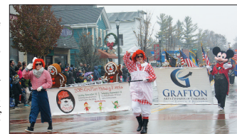
Grafton Christmas Parade

Thursday, Nov. 28, consider a trot or walk through the streets of Thiensville with the 5K Turkey Trot & Gobble Gallup. Festivities begin at 9 a.m. at Village Park, and the event benefits various nonprofit organizations. Visit www.juniormt.org for more information.