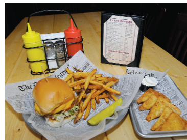
Skippy's Burger Bar